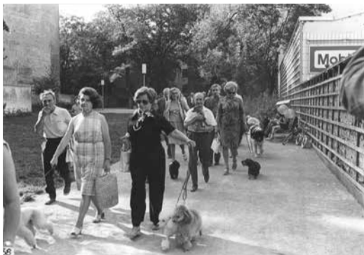
On the event: The Planquadrat. Would it Still be Possible Today? The Planquadrat before renovation

Wed, Mar 15 & Sat, Mar 18 (with curators), both 17:30