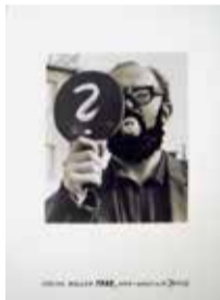
Július Koller UFO-mat J.K. (U.F.O.) Bearbeitete Fotoproduktion mit Zeichnung aus dem Jahr 1970

mumok kino Wed, Mar 8 & Tue, Mar 29, 19:00