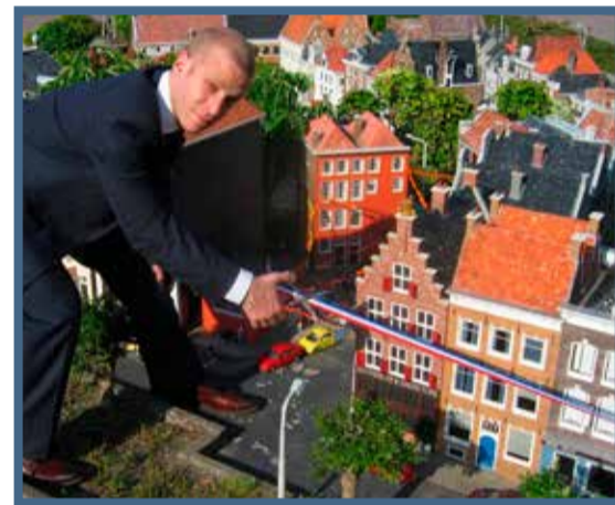
Herzog Nadler: Stimmt. Photograph, detail from newspaper The Monograph, 2006.