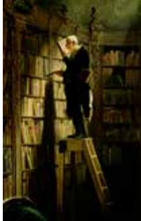
Carl Spitzweg, The Bookworm, 1850, Museum Georg Schöller, Schweinfurt