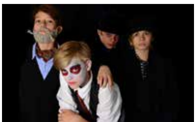
Giant*Dwarfs

Mon, Mar 20 & Tue, Mar 21, 19:30 Dance theater for ages 14 and up