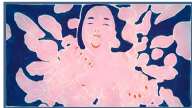
© 2015 Shishi Yamazaki All Rights Reserved.