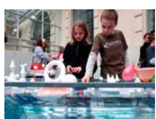
Splash! Splash! Balderdash!, ZOOM Kindermuseum. ©Alexandra Eizinger