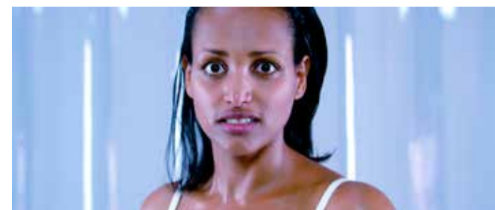
Q21 XAVIER CHA, STILL FROM ABDUCT, 2015