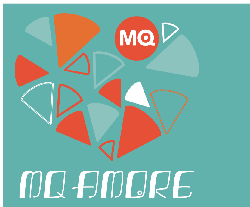
MQ Amore