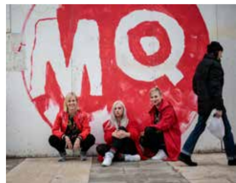
Etepetete ©Gerns Livia Pysa

Top level musical entertainment that is unashamedly infectious is exactly what "Edgar Tones & The Su'sis" are all about.