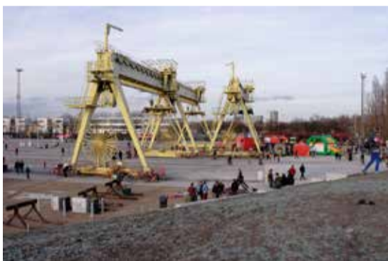
On the event: ROTOR. Lecture Rotor, Spoor Oost Project, Antwerpen/BE, 2014–2015