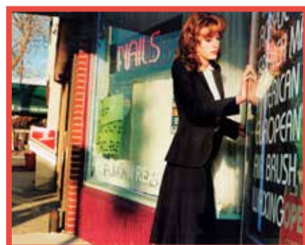
New Jersey Shopping, 2003/2006

Date: Apr 10 to 30, daily 10:00 – 22:00 Location: EIKON Schaufenster Free admission