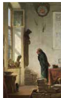
Carl Spitzweg, The Cactus Lover, 1850, Museum Georg Schäfer, Schweinfurt